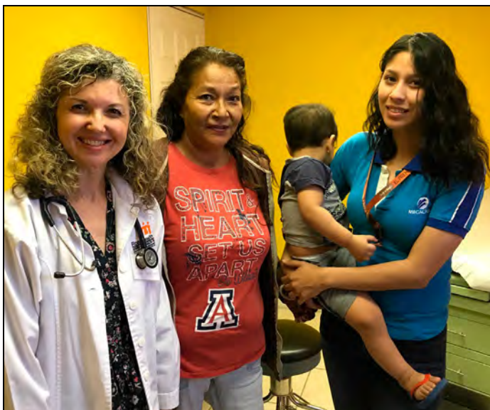
Mexico medical mission trip in May 2019.