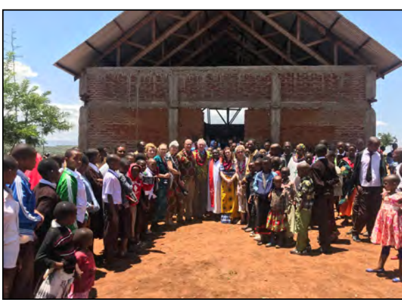
Barray Lutheran Church.