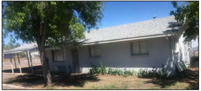
FaithWorks cleaned and fixed up Resource Center, which is part of the Abide Ministry.