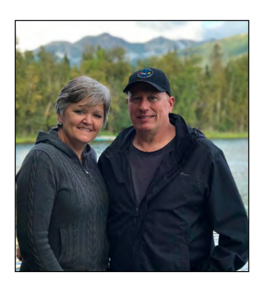
If you really keep the royal law found in Scripture, "Love your neighbor as yourself," you are doing right. James 2:8