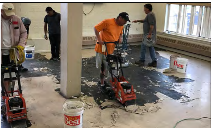
Scenes from the Sunshine Rescue Mission Trip.