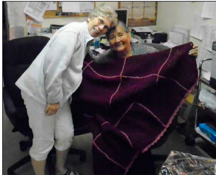
Helping our neighbors in Leupp.