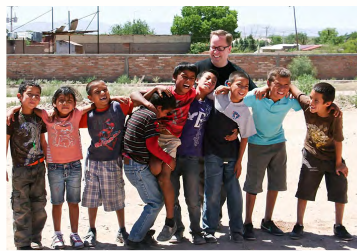
Some of the children on the May Medical mission trip in Agua Prieta, Mexico.