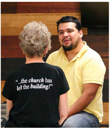
“The Church has left the building,” left, says it all. Photos of our mission trips these past three months: Olive Branch washing windows (top right), Mexico enjoying a gift of a blanket (bottom right), Camp Civitan at lunch (bottom left).