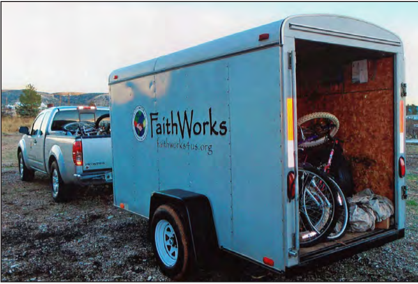
FaithWorks vehicles full of bicycles that were taken to Agua Prieta, Mexico, to be donated to the people of Colonia Empacadora so they could more easily get to work.