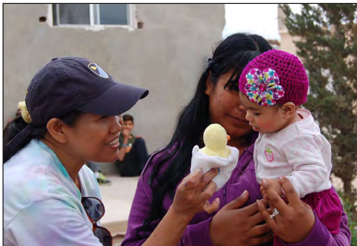
The Medical Mission Trip, Agua Prieta, Sonora.

But if you were to ask these spiritual drifters, "What has happened to you?" They might disagree believing they're doing just fine with God's call upon them to go and share the gospel through both word and deed. Yet, they don't do what they say. Their walk doesn't match their talk.