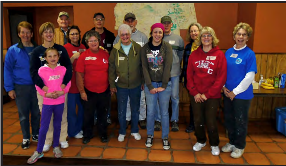
The El Nathan Mission team, ready to paint.

In-kind donations are welcome during office hours; please call office before bringing in large donations. Thank you!