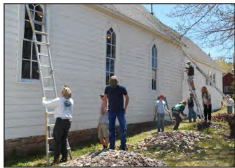
Everyone had a place on the wall to paint.