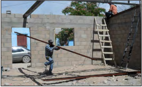
Workers building the new building extension.