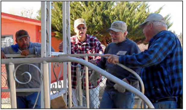
Repairing a damaged porch.