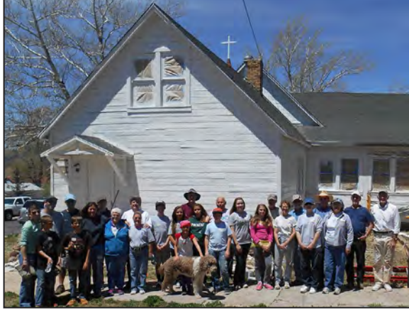
30 missioners from 8 different churches—not counting the dog!

The original building erected 124 years ago!