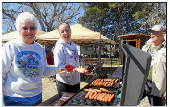
A mission team moves on its stomach!