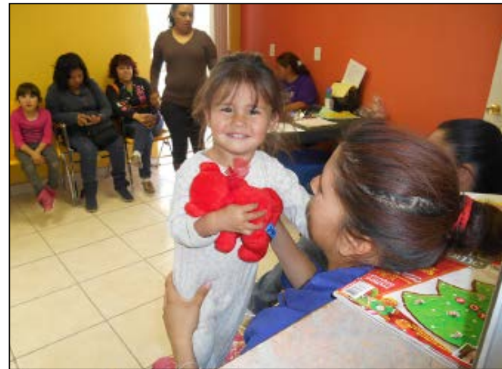
Happy little girl with our new gift of her own Beanie Baby.