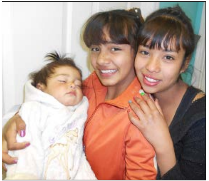
Patients at the Mexico medical clinic, February 2014.

Non-Profit Org. US Postage PAID Flagstaff, AZ Permit No. 102