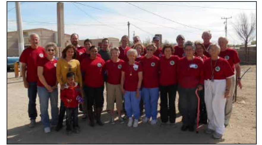
The 32nd Mexico Medical Team.