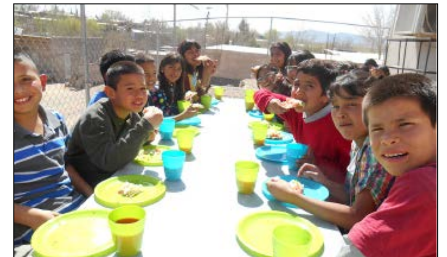
During the clinic, children at the "Saturday School" held at Fuente de Vida Iglesia each week. They also provide them with lunch. About 45 kids attend each Saturday for Bible studies, crafts, and lunch.