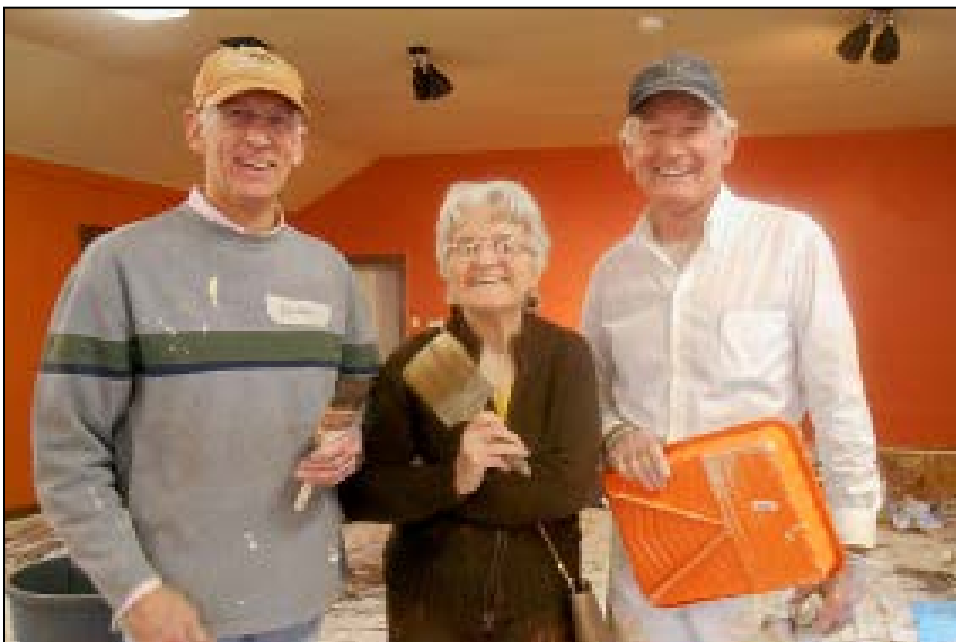
Mission Team members at the El Nathan Camp in Flagstaff in January.