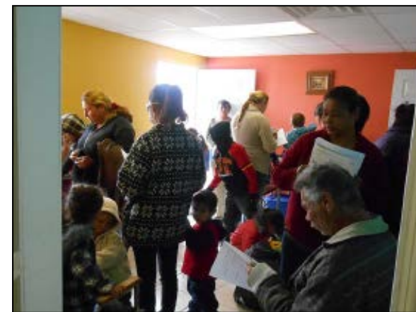
Our crowded waiting room!