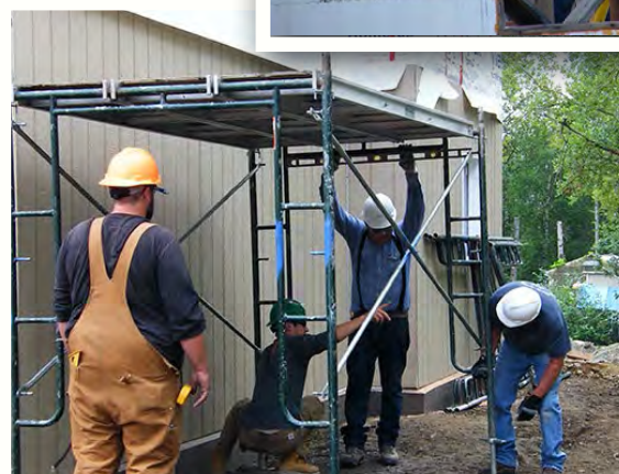
Hard hats and scaffolding are a must!.

We are looking forward to having FaithWorks back again in 2015!