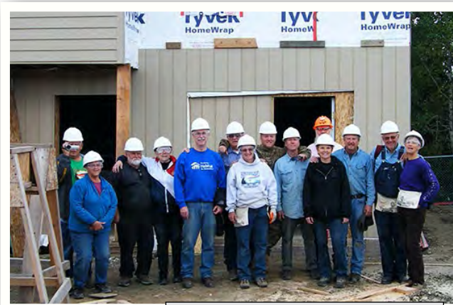
The Alaska Mission Team, 2014.