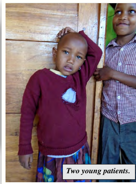
Two young patients.