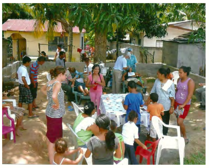
Outdoor dental clinic & kids' ministry, Honduras mission.

Non-Profit Org. US Postage PAID Flagstaff, AZ Permit No. 102