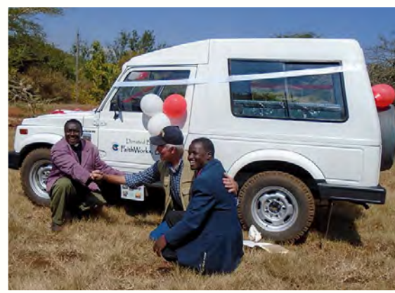
Dedicating the new donation.