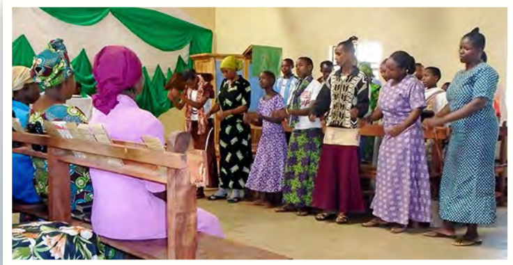
Worship at Kilimomoja Church.