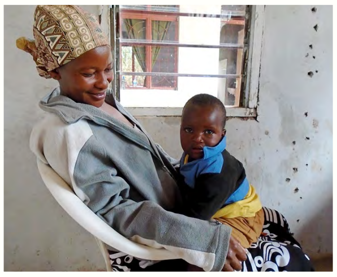
An African patient and child at our clinic.