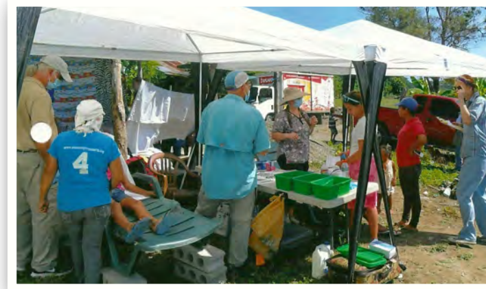
The chaise-lounge dental clinic!