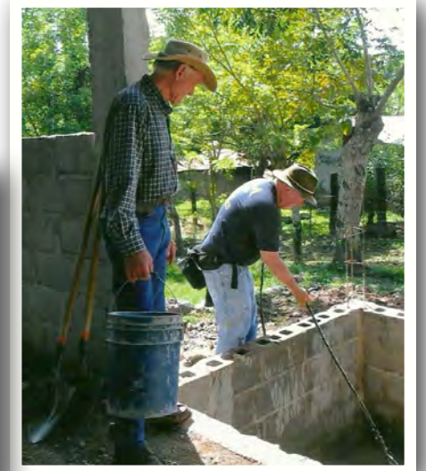
Cleaning out a septic tank.