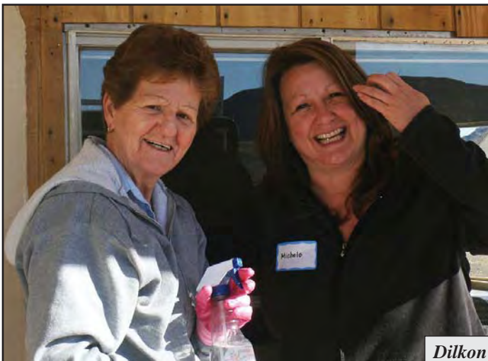
Dilkon mission trip.

Life happens, and we as Christians know this more than anyone, don't we? But we have a God who gets us through life-happenings, one who loves us and encourages us to go on when all seems lost. Many thanks and praises to you for your support, prayers, and participation in this mission.