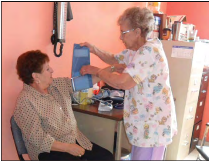
The May Mexico medical clinic.

Again, we thank you for your heart for missions and for reaching out to a needy, hurting world.