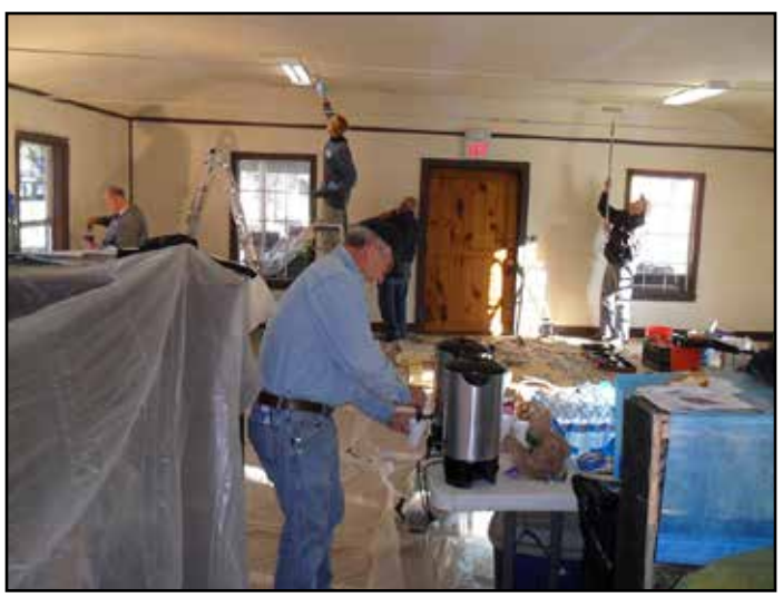
Many painters go to work in the chapel.