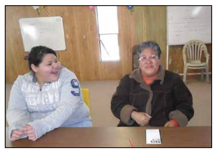
Two eye patients have their vision checked to find the right glasses.