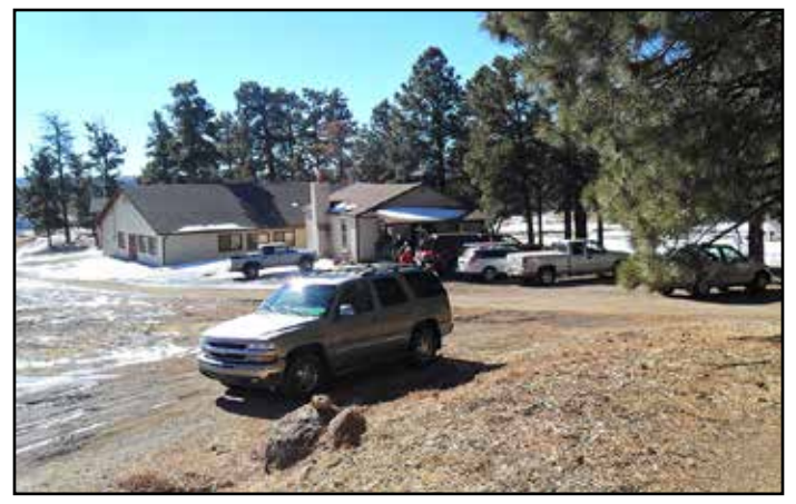
The grounds at El Nathan ministries.