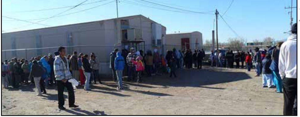
A long line forms outside the clinic as people wait to see the optometrist.

All the above and so much more good that we don't even know about would never have happened if we had never gone. Thanks to each of you for your prayers, giving and going to make missions like this really happen!