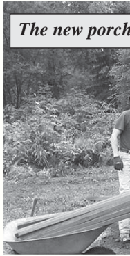
The new porch