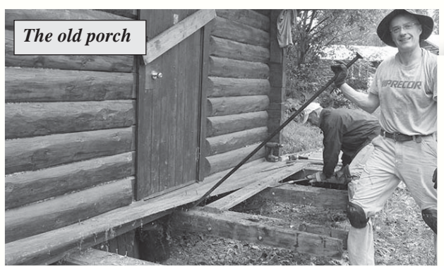
The old porch

One of the camp staff told us, “You’ve done more for us in one week than we could have done all year long! Thank you!”