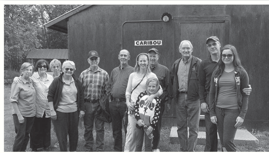
The Alaska mission team at Birchwood Camp, ready to tackle a multitude of projects to help with the camp’s upkeep.