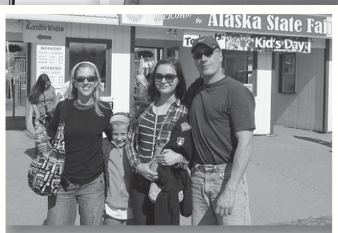
Much work was done, but we had fun, too!