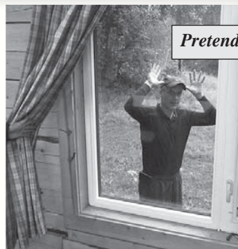
Pretend moose and real moose