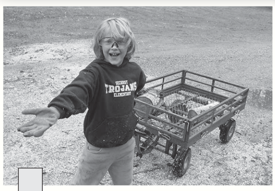
Much wood is hauled, split, and stacked.