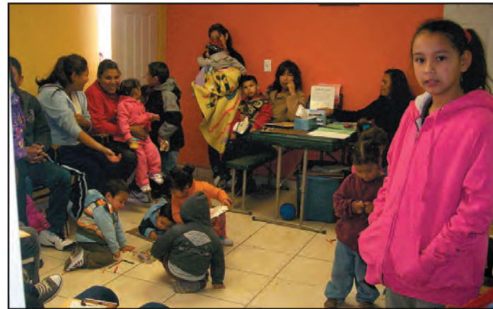
The waiting room—always a bustling place.

This very poor community started off as a squatter settlement with people independently constructing their own houses out of wood or cinder blocks, many houses