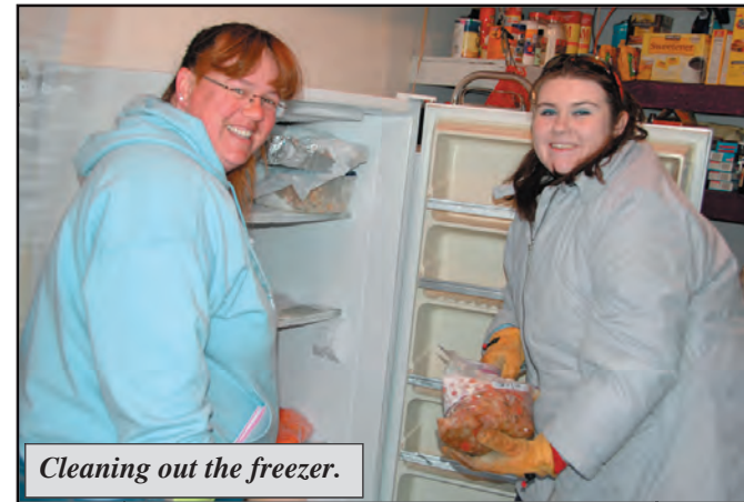
Cleaning out the freezer.