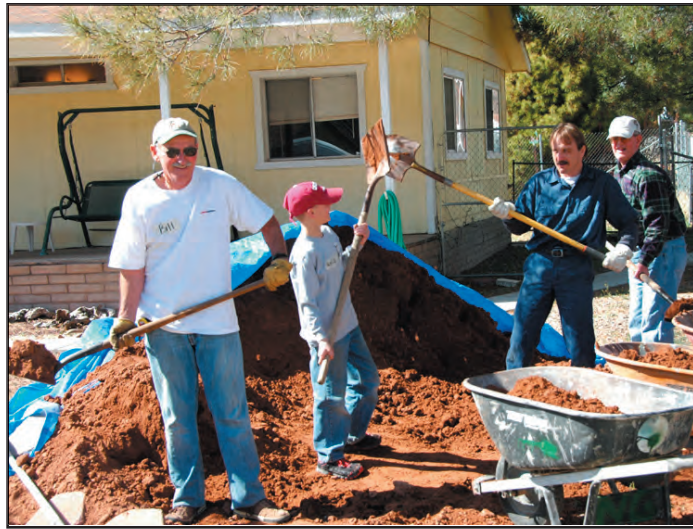
We had lots of help shoveling at the Olive Branch mission.