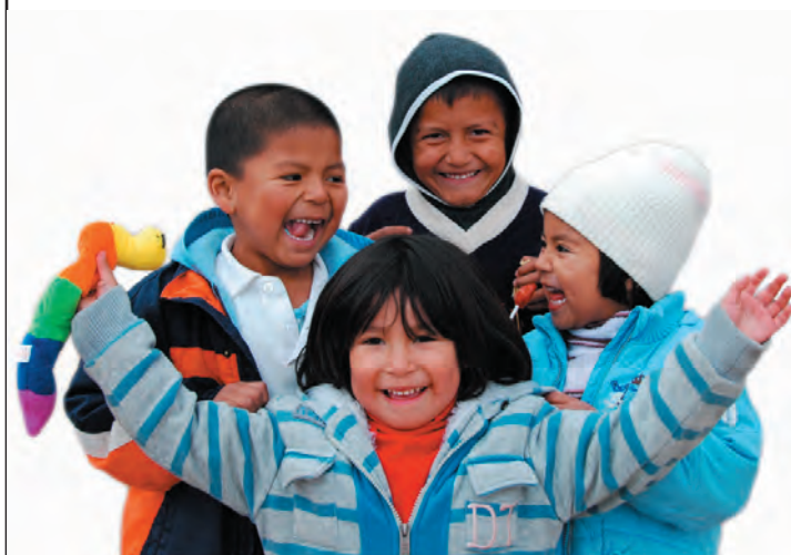
Children at the Mexico Medical Mission trip in February.

We enter 2012 with that same trust in God's provision through His people to meet the needs of His Kingdom work.