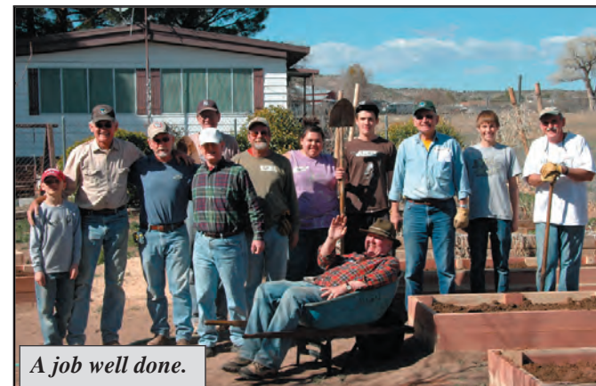
A job well done.