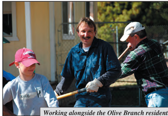
Working alongside the Olive Branch residents.