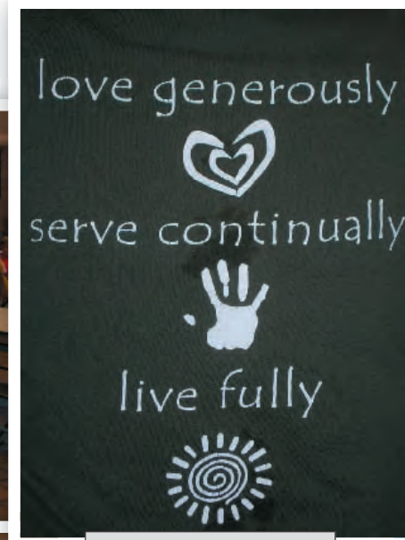
A banner at the school.