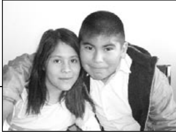
At the medical clinic in Mexico.

Making FaithWorks part of your estate will leave a legacy of good works that will change lives.