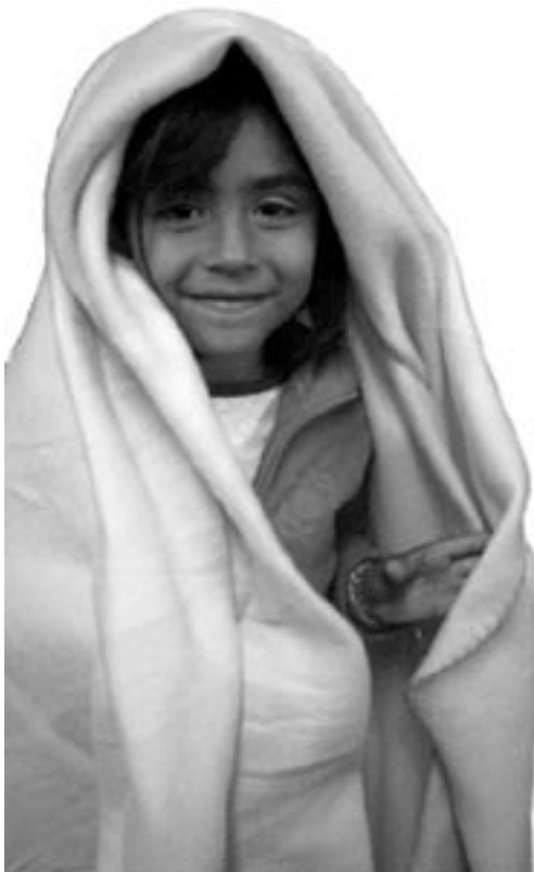
A girl at the medical clinic in Mexico receiving one of our blankets.

Another "widow's mite" type gift is the $12.50 per month gift for general orphan support in our work in Tanzania. Also, a faithful lady in Casa Grande gives us Beanie Babies and used children's books. Someone else wanted to