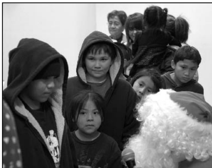
Thanks again for all who participated in December's work day and Christmas party on the Navajo Reservation in Leupp!