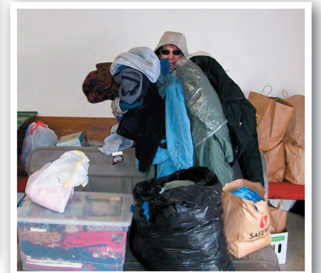
Coats and more coats.