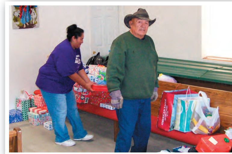
Unloading the presents.