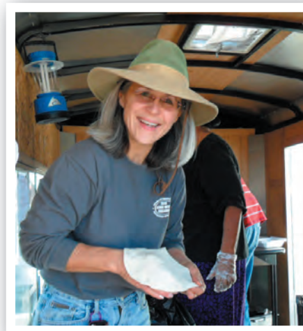
Scenes from Leupp in October