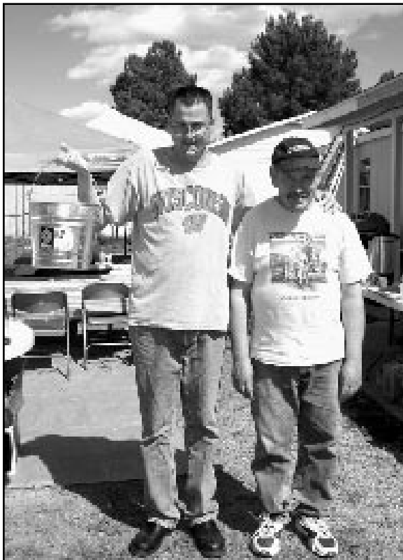
Two residents of the Olive Branch.