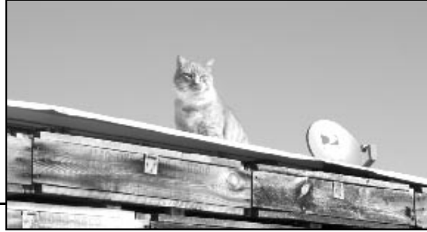
A cat on the roof watching the Olive Branch mission team at work.

Making FaithWorks part of your estate will leave a legacy of good works that will change lives.