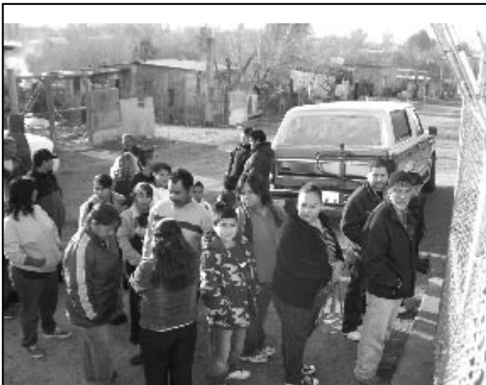
People waiting for the clinic to open.

The dentist and optometrist were overflowing with visitors, getting teeth pulled, cavities filled, and glasses